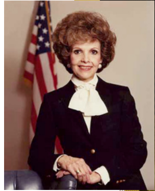
SENATOR PAULA HAWKINS

Recognizing a person who has labored diligently to protect children and strengthen families.