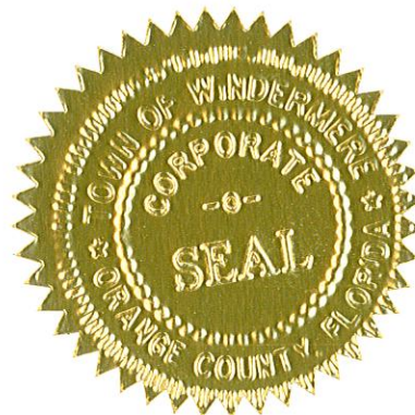
Gary Bruhn, Mayor, Town of Windermere